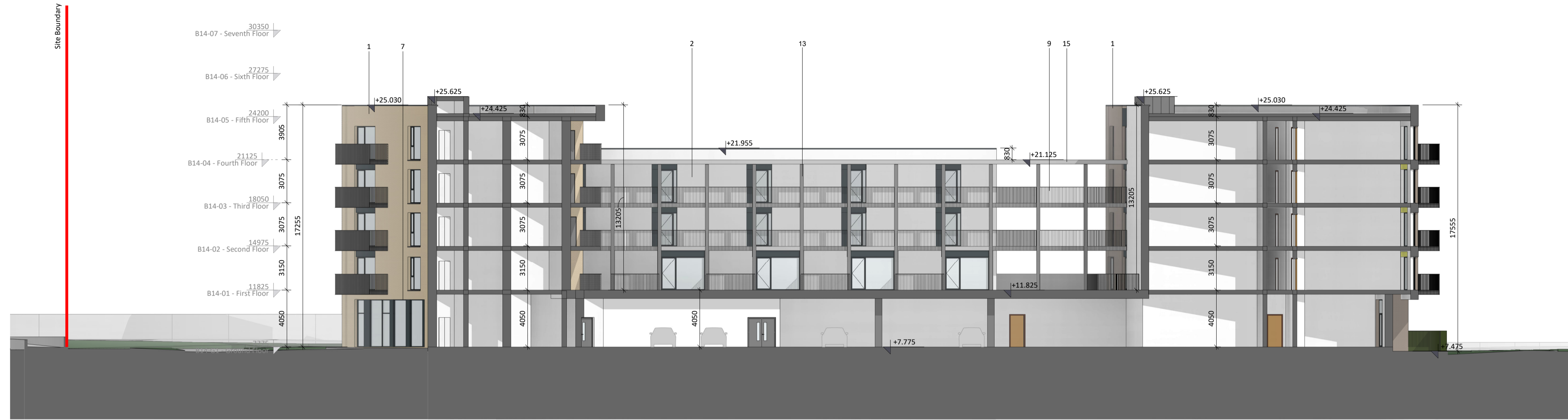
1 B14 Section C-C 1:200