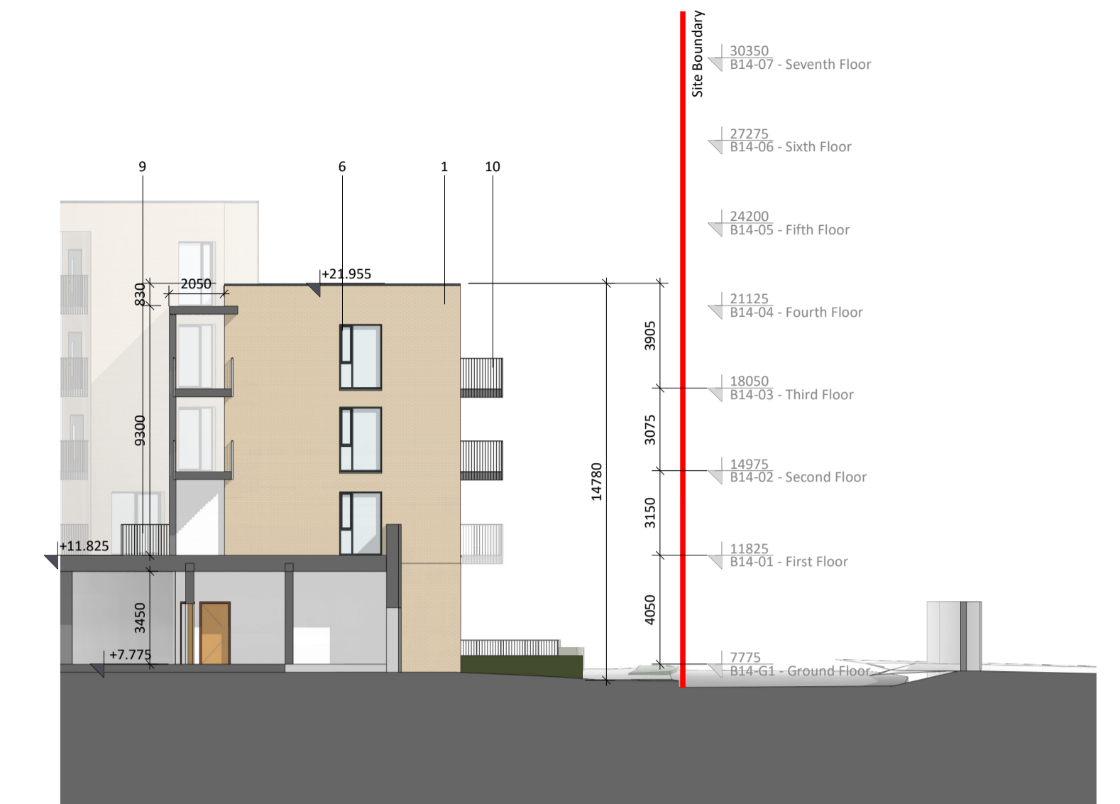
3 B14 Section E-E 1:200